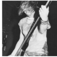
Commissioned Work Roland Owsnitzki »Keller - 80 Fotos aus den 80er Jahren« (Exhibition)