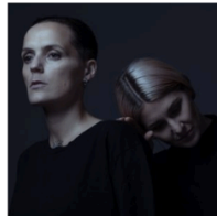
Commissioned Work Evvol: Human Resonance